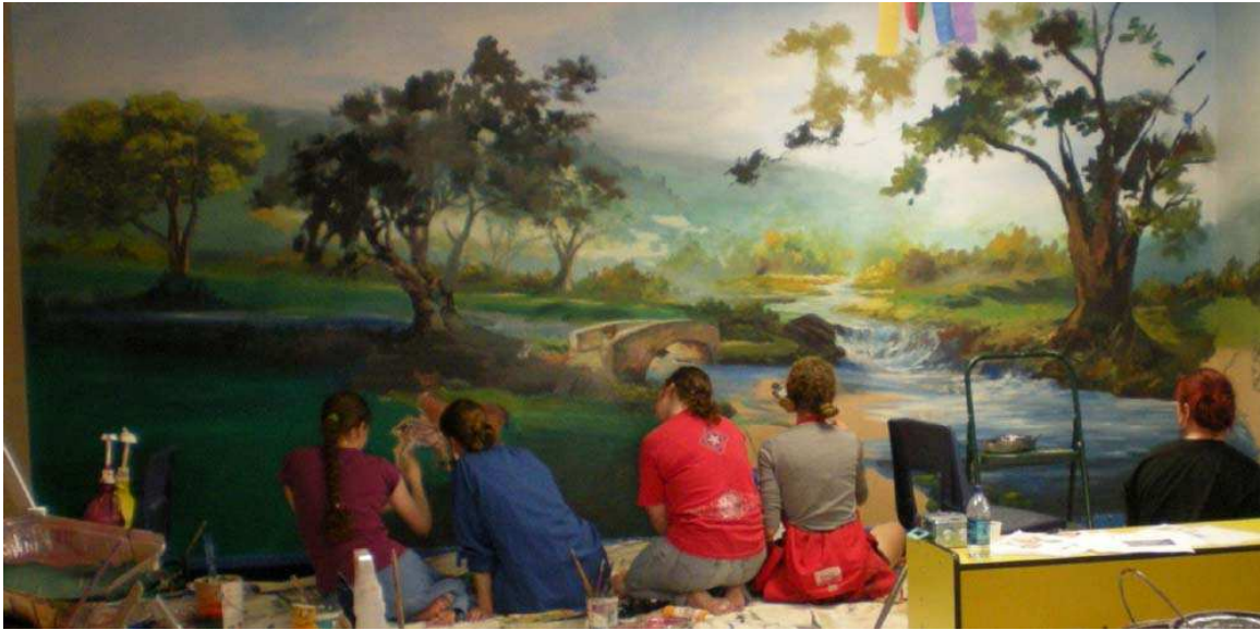
College Mural Class at Sunnyside Foursquare Church