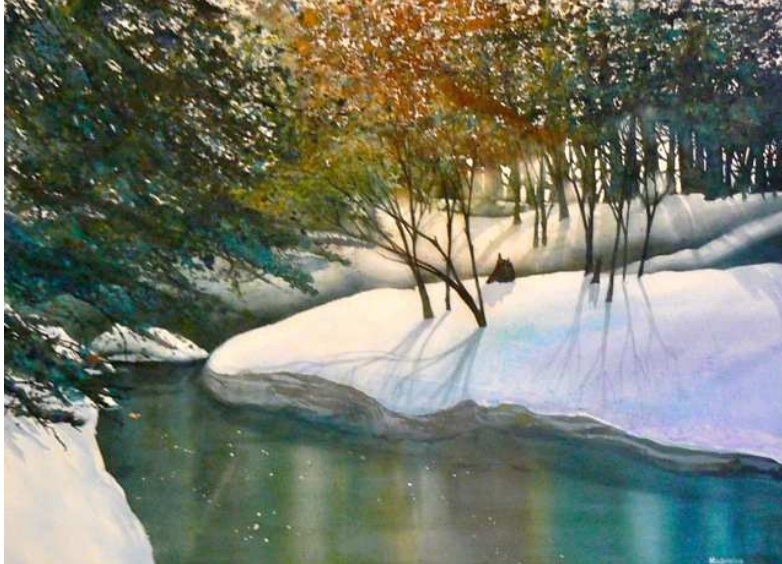
Watercolor by: Madeleine Crowdus, our new watercolor instructor